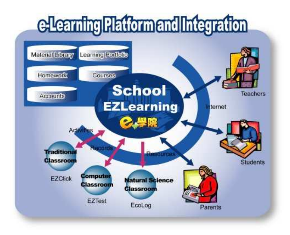
Figure 3: School EZLearning

What is EZLearning .EZLearning is a platform built to help teachers better manage materials, resources and learning results, with this platform students can learn and obtain knowledge through internet activities.