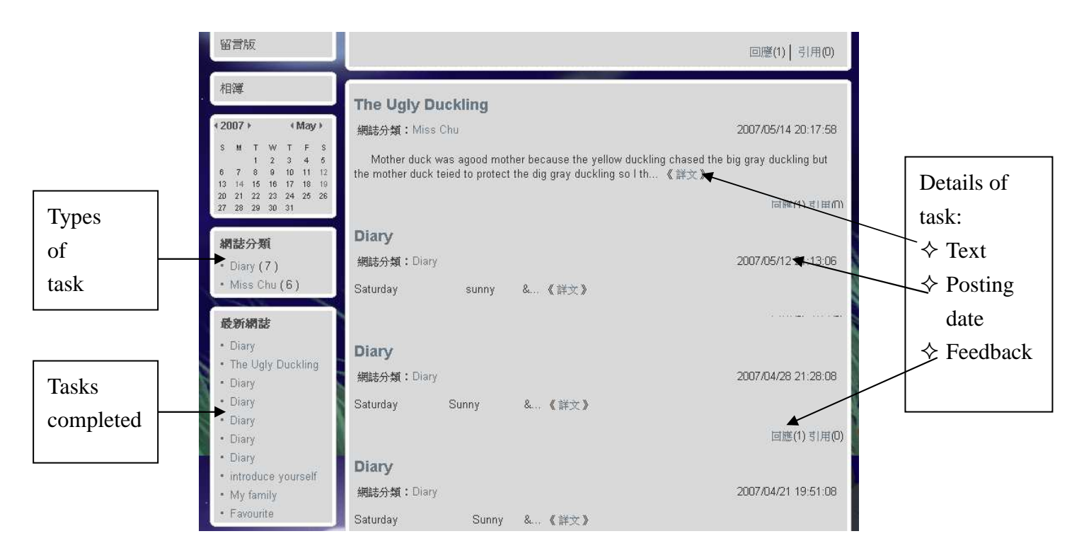
Fig.1: Details of student's work

Throughout the process, observation of students' daily work (as in Fig. 1 and Fig. 2) and online data would be collected and analysed. The final feedback and evaluation would be collected before examination. The performance of students in their examination would be considered as one of the reflection in the project.