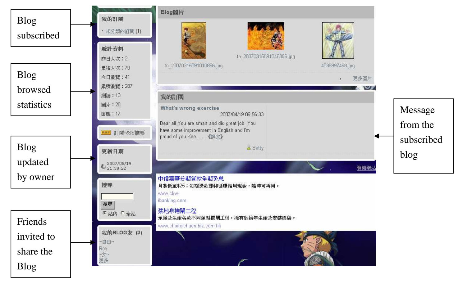
Fig 2: Statistic and information from student's blog

From the details of student's work online, investigation of data would be focus on their: