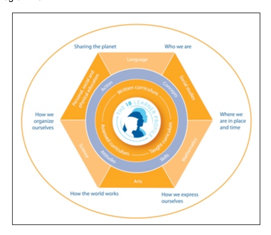
Figure 1: Model of the PYP from the IB website, May 2009: <a href="http://www.ibo.org">http://www.ibo.org</a>

The International Baccalaureate's Primary Years Programme (PYP) described in the framework document "Making the PYP happen" (2007) promotes learning through guided inquiry. It is an educational programme spanning the years from ages 3 to 12. This paper will introduce the audience to a very brief overview of the five essential elements of the PYP and demonstrate how Information Literacy skills are embedded within the programme.