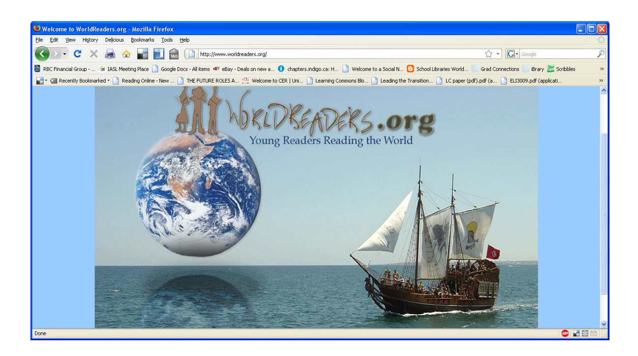
Figure 1: Screen Capture of WorldReaders.org

The WorldReaders social network (SN) site started by using a freely available tool for creating a SN called Ning. Participants are not able to join WorldReaders until they have signed both a consent from parents and a personal assent form. Then, their teacher-librarian sends me email addresses and I send them an e-invitation to join WorldReaders. They are then free to create their personal profile on the site called MyPage. Participants are not allowed to post their personal picture, nor are they to use their real names as their WorldReaders ID. At each school, students are free to create a personal icon and an online "name" which can be uploaded and used as their ID on the site. The nature of the SN software meant that no one could access the network who had not been assigned to it; someone browsing the Internet would not be able to identify or find any participant by photo or name. Figure 2 is an image of the SN homepage for WorldReaders.